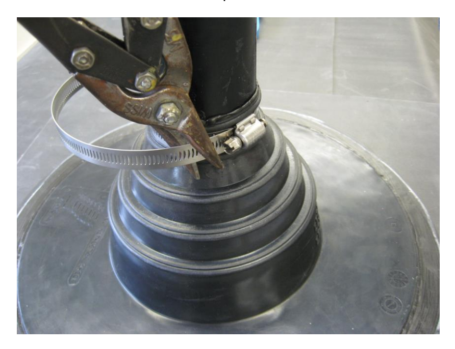
The finished detail.