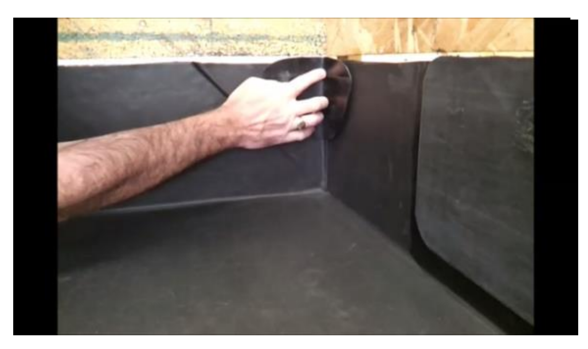
Fig 1: Offering up the FormFlash patch to the internal corner.

Draw around the patch leaving an extra gap all around the edge, which is where the Quickprime Plus adhesive will be applied.