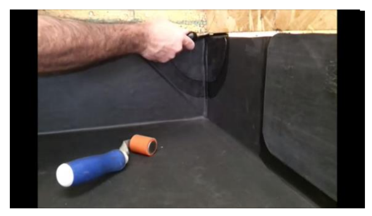
Fig 4: Using the penny roller to make the seal on the top edge.

Using the penny roller, manoeuvre the FormFlash patch into position on the top edge, pressing firmly to ensure a watertight seal.