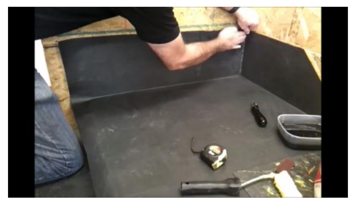
Fig 10: Offering the sheet up to the back wall to secure.

When it's sufficiently tacked off, offer the sheet up to the back wall, and it should stay in position.