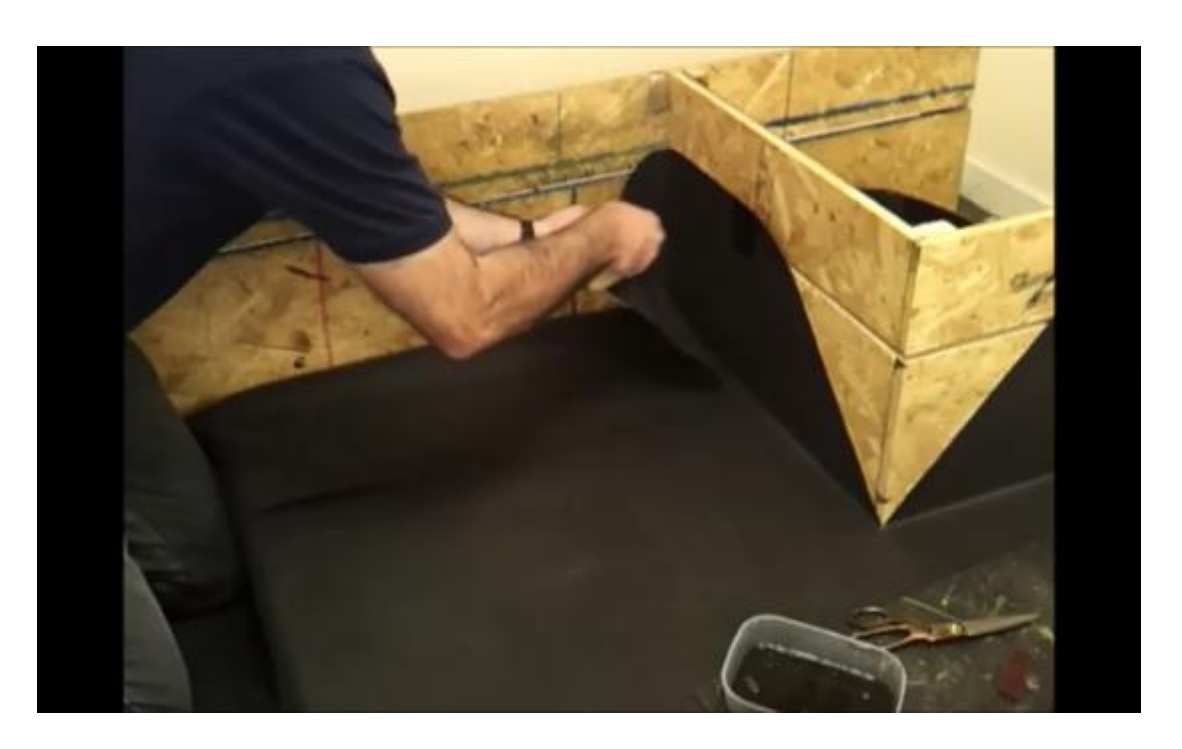
Fig 2: Tying the sheet membrane temporarily out of the way.

Tie the little piece of EPDM onto the back wall. This keeps the sheet membrane out of the way while the bonding adhesive is applied.