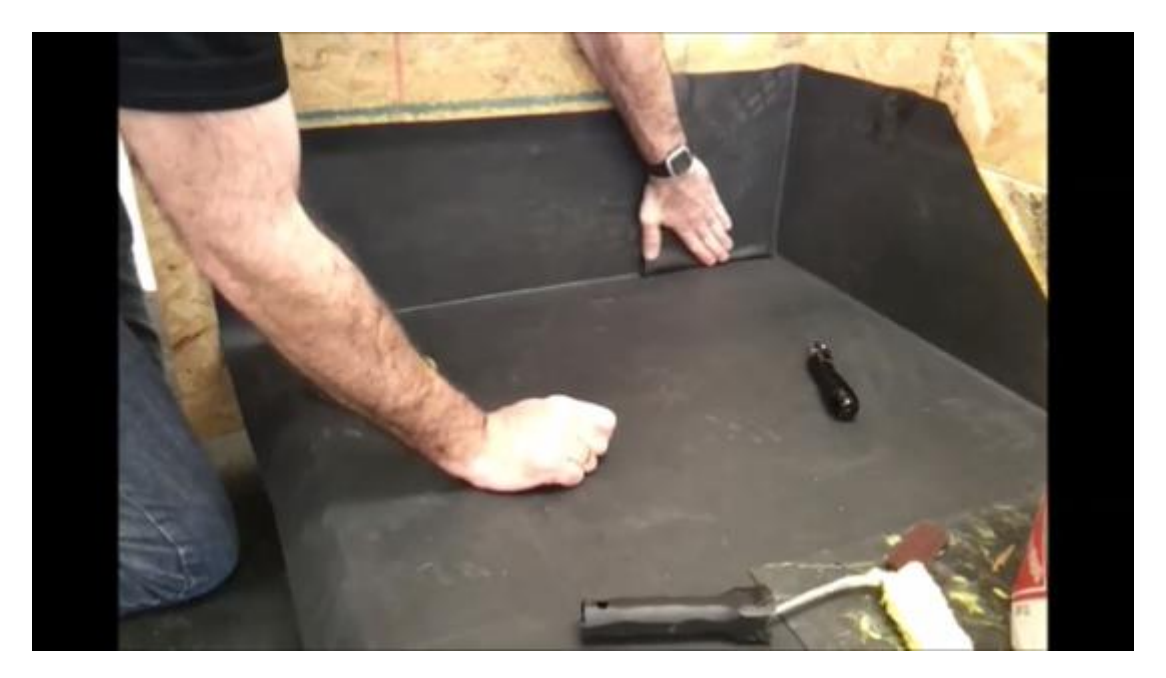
Fig 8: Ensuring the fold is made accurately.