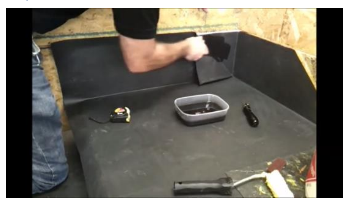
Fig 9: Securing the flap to the back wall with Quickprime Plus.

Any of the excess membrane is removed, leaving the flap intact and secure to the back wall. Use the Firestone Quickprime Plus for that.