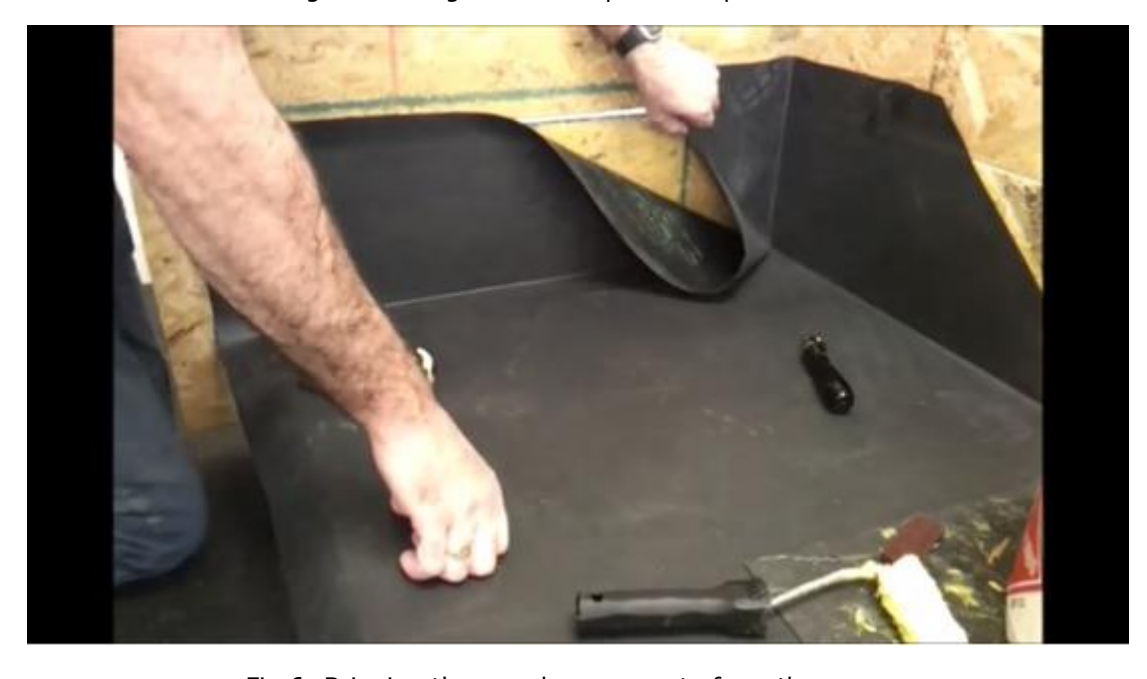
Fig 6: Bringing the membrane over to form the corner.