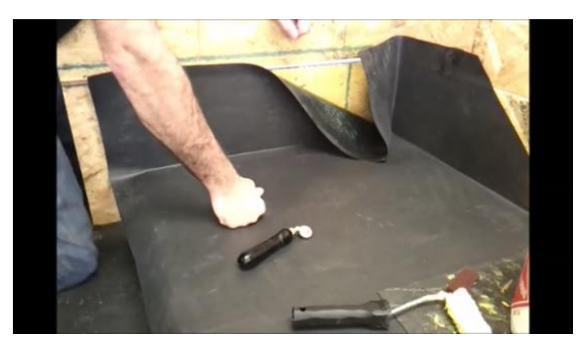
Fig 5: Offering the sheet up to the upstand wall.

Offer the sheet up onto the wall and begin to form the internal corner detail. Measure the drop from the edge of the membrane and from the internal corner. Bring the membrane over, after using the penny roller to form the corner drop.