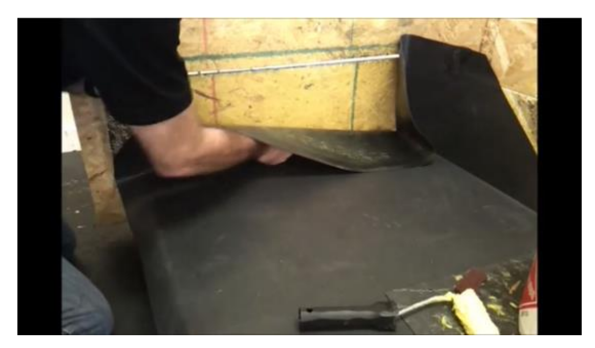
Fig 4: Using the penny roller along the bottom of the upstand wall.

Once you have established that both surfaces are ready to be mated, you can offer the sheet into position, form it into the angle change, using the penny roller for assistance. This will make sure there is no tenting or bridging of the sheet membrane.