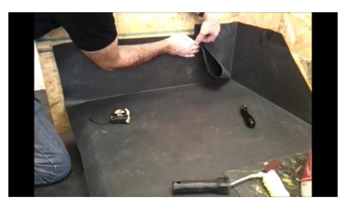
Fig 7: Bringing the two edges together to make the fold.