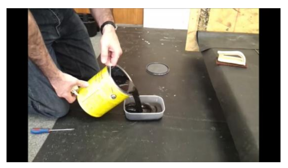
Fig 1: Decanting mixed Quickprime Plus into a small container.

Put the lid firmly back on the tin afterwards.