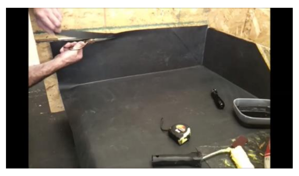
Fig 11: Trimming off the excess membrane.