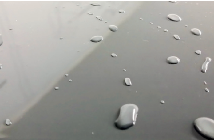
20 year guarantee