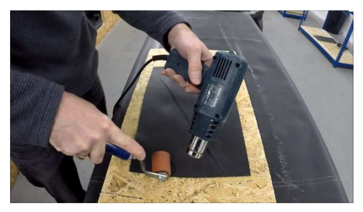
Fig 3: Working quickly and evenly across the membrane.

Work quickly and efficiently across the creased area without remaining in one place for too long.