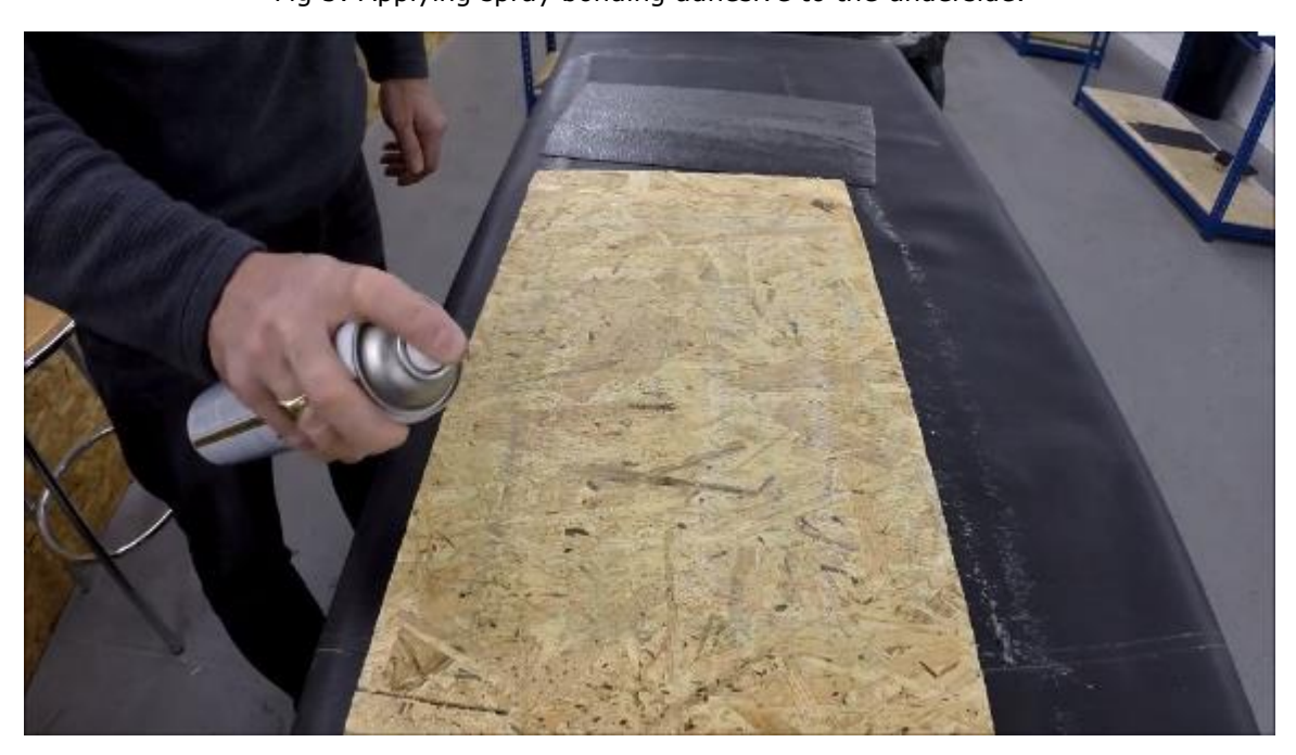
Fig 6: And to the roof substrate.