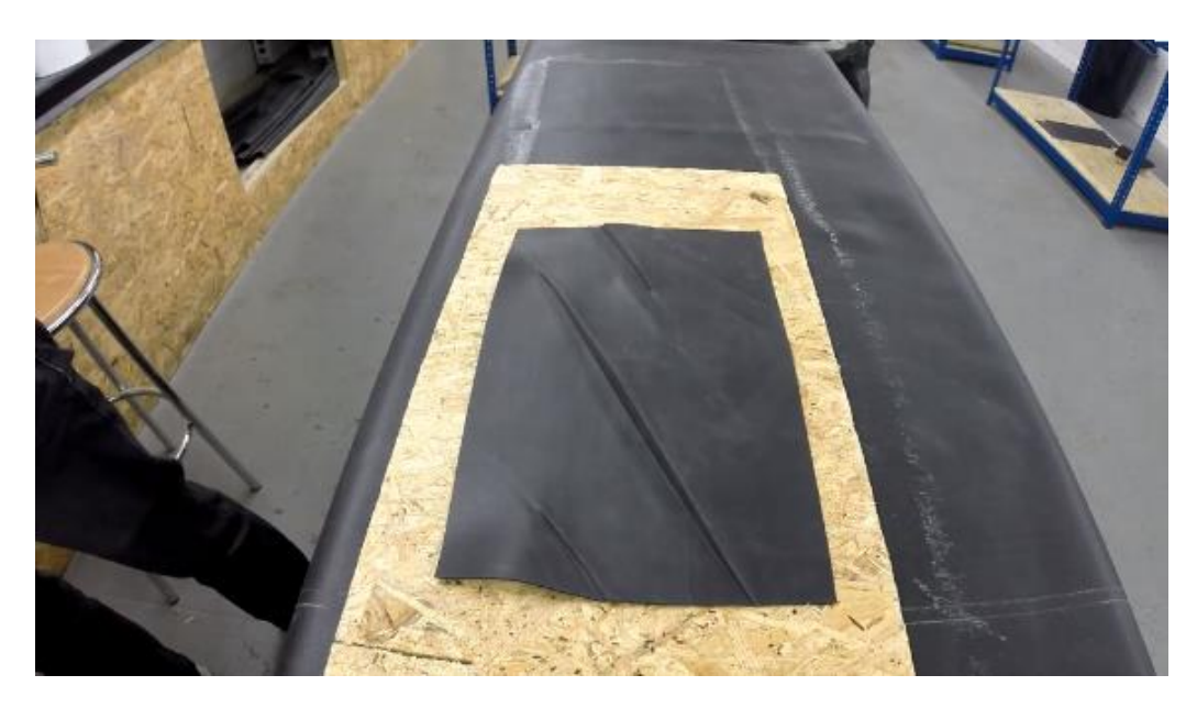
Fig 1: Laying out the creased EPDM membrane.

Lay out the creased EPDM membrane and smooth onto a flat working surface.