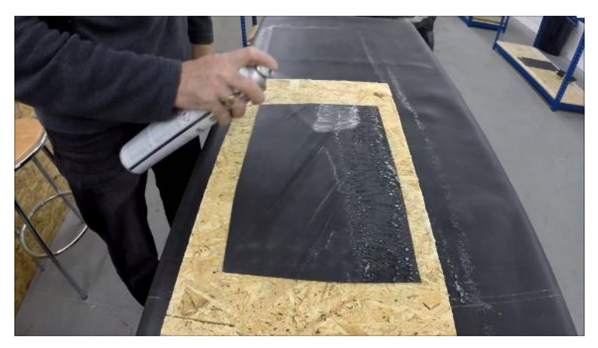
Fig 5: Applying spray bonding adhesive to the underside.

Apply bonding adhesive to the membrane underside, and to the roof substrate.