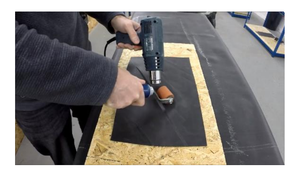
Fig 2: Heating the EPDM membrane and smoothing with the silicon roller.

Using a heat gun, gently heat up the surface of the EPDM membrane and smooth out the creases using a silicon roller.