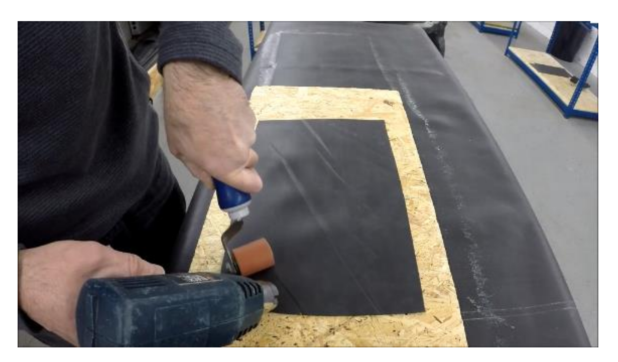
Fig 4: Applying gentle, firm and consistent pressure to iron out the creases.

Apply gentle, yet firm and consistent pressure to the roller to remove the creases.